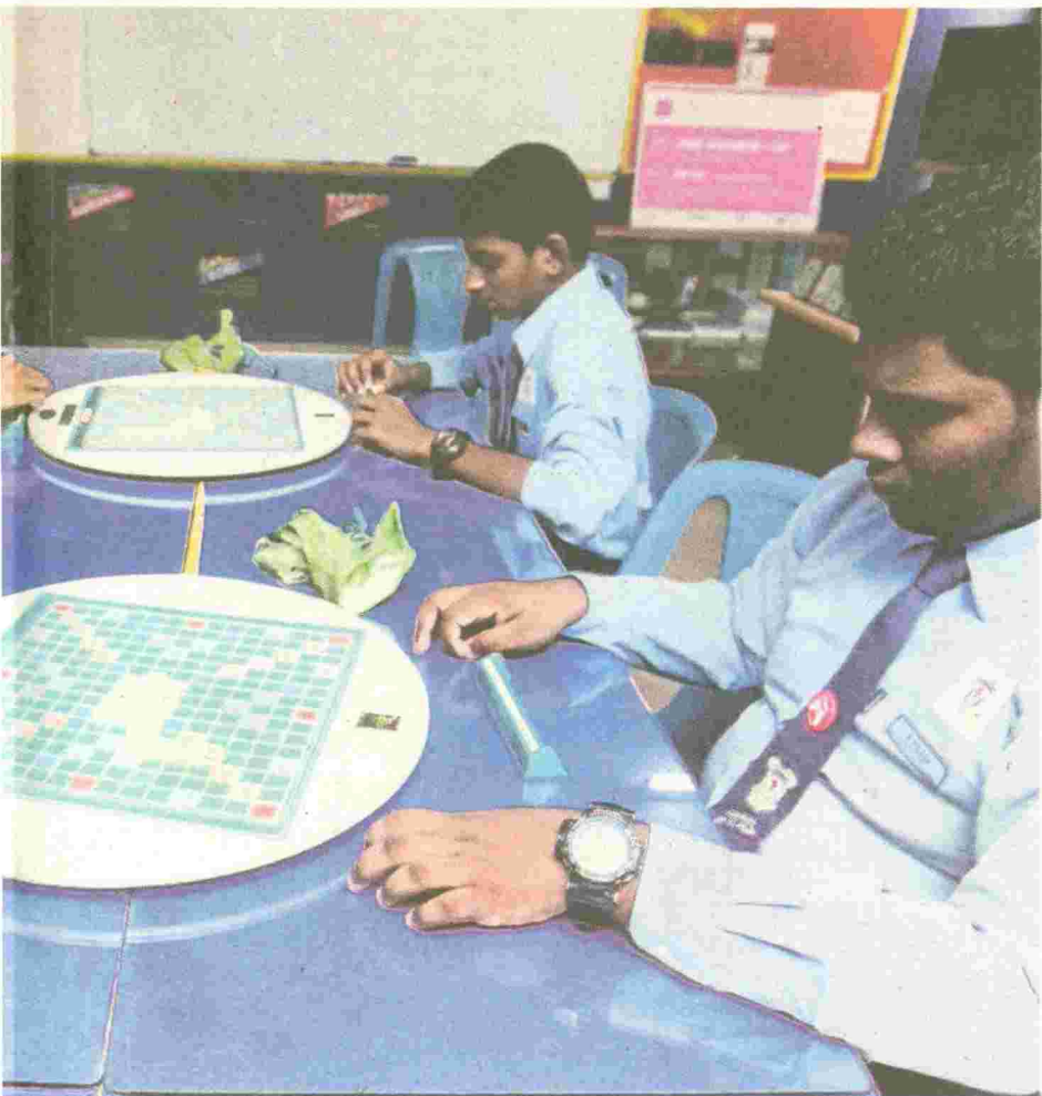
The Scrabble Club in SMK Sungai Pelek was started more than 10 years ago.

composure and continues, 'I give you my word, Teacher, that we will do the work. We will help find the money.'