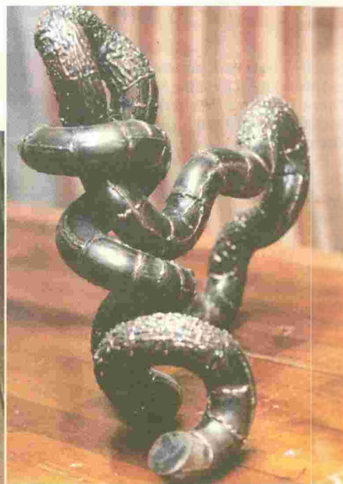
With Faiz's The Thinker sculptures, people are free to interpret the form

er. Second, they represent times of difficulty and remind him of his struggles as a young artist.