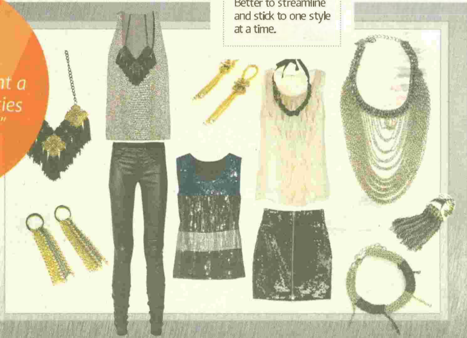
The Night Sparkle looks