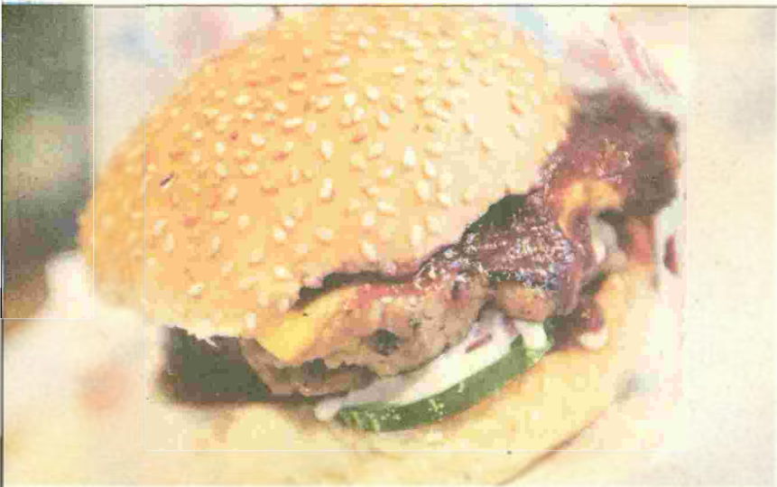
One of the mouth-watering selections of burgers served here.