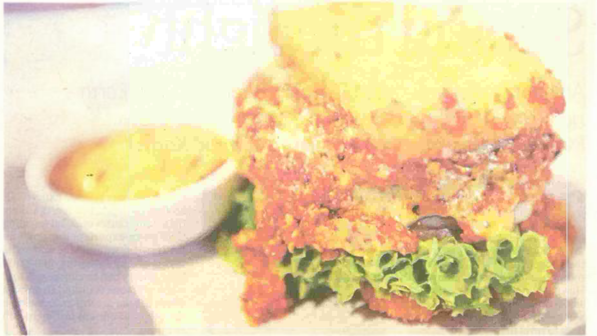
Plenty of options for discerning taste buds .