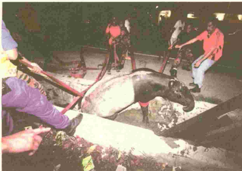
Megat, the tapir who fell into a monsoon drain.