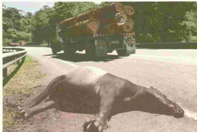
Kai was knocked down by a vehicle along the Karak-Kuantan highway.

imagine yourself as Megat, Kai and Im? How would you feel and what would you do?" Both researchers say that since many of the children were from schools in Pahang and they knew where the Karak-Kuantan highway is, the response was more emphatic. They were more willing to be engaged with any conservation efforts she shared with them.