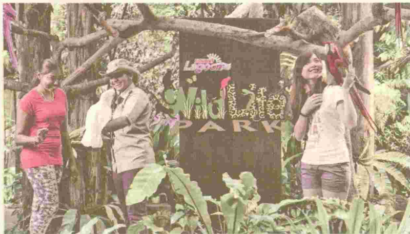
There's much to enjoy at the interactive Wildlife Park.

Readers are required to collect five different coloured coupons that