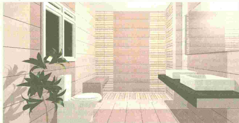
3-dimensional view from the front

the lowest slip resistance level and R13 is the maximum.