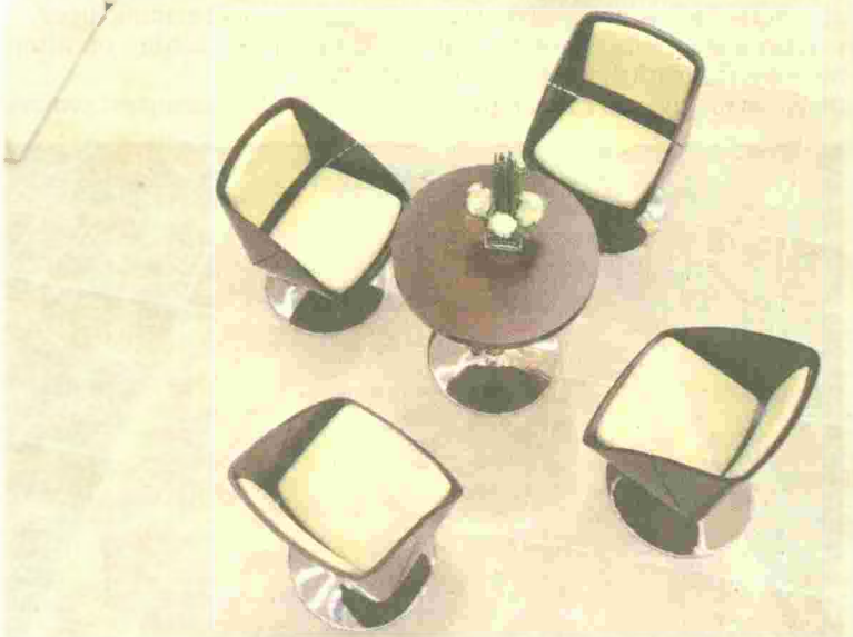
Guocera Digital Glazed Porcelain - Pietra Collection (Pietra Toscana Beige)