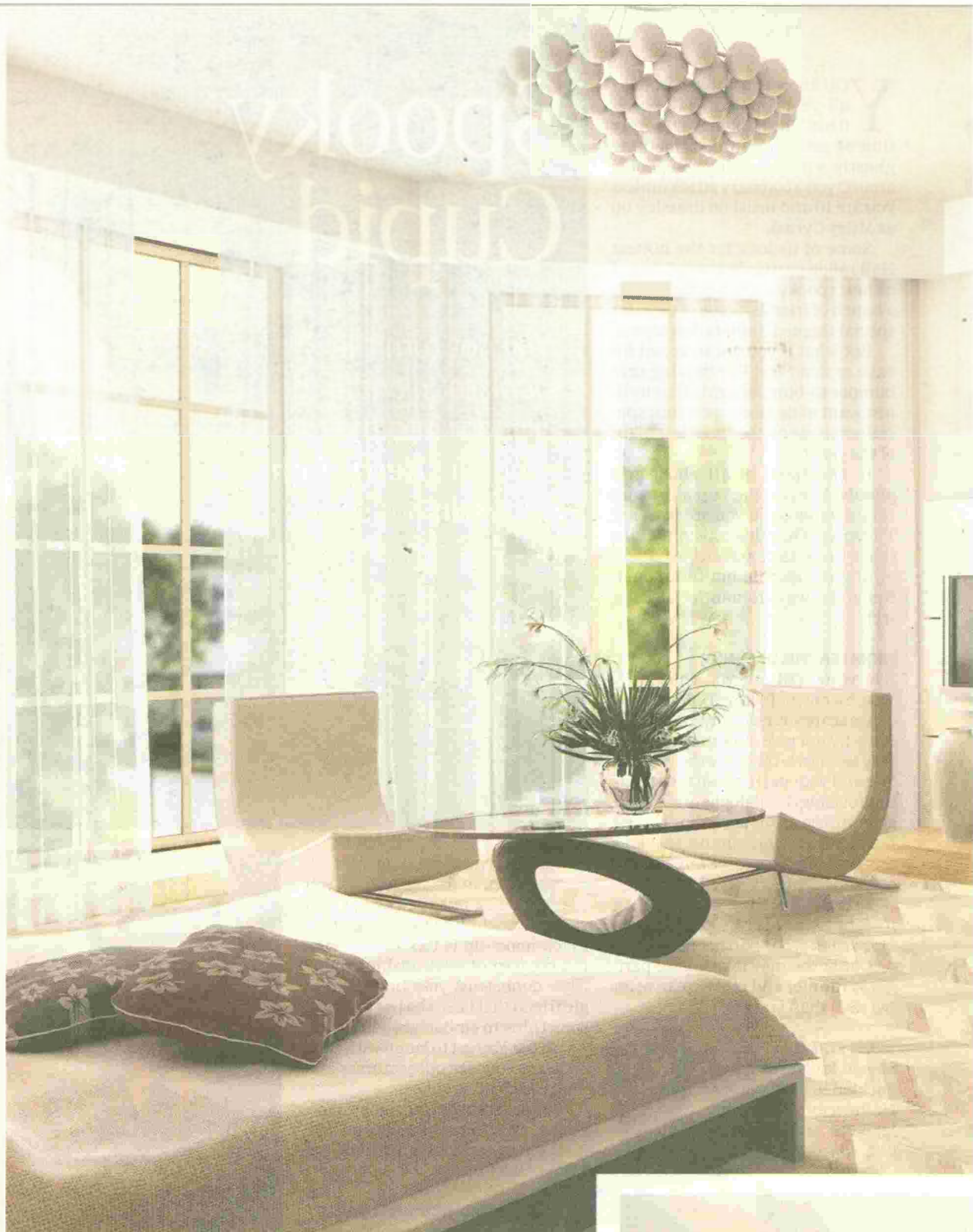
Guocera Digital Glazed Porcelain - Parquet Collection (Tamara Pine)