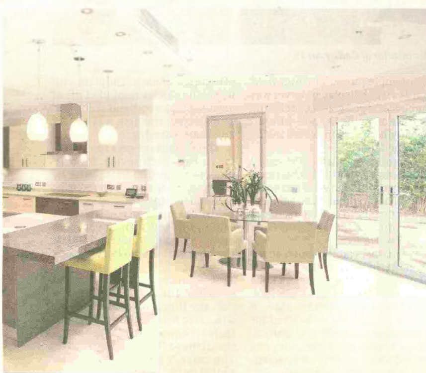
Guocera Digital Glazed Porcelain - Seta Collection (Satin Marfil Creame)

In the end, you cannot deny the durability of porcelain and ceramic tiles. With this new collection from Guocera, there is technology that you can benefit from to have the kind of design and finish in your living space that will suit your lifestyle as well.