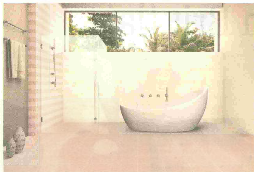
Bathroom featuring Guocera Digital Glazed Ceramic - Opulenz Collection (Soul Series)