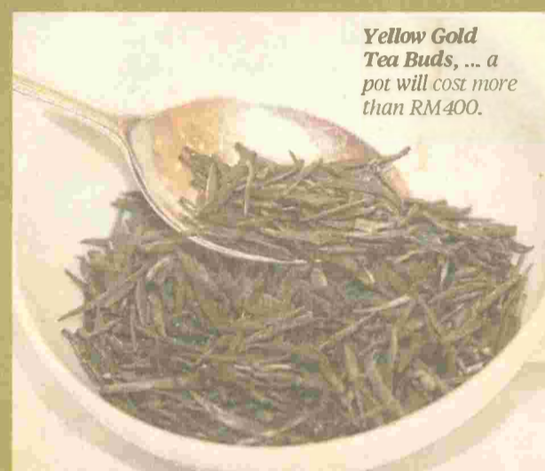
Yellow Gold Tea Buds, ... a pot will cost more than RM400.