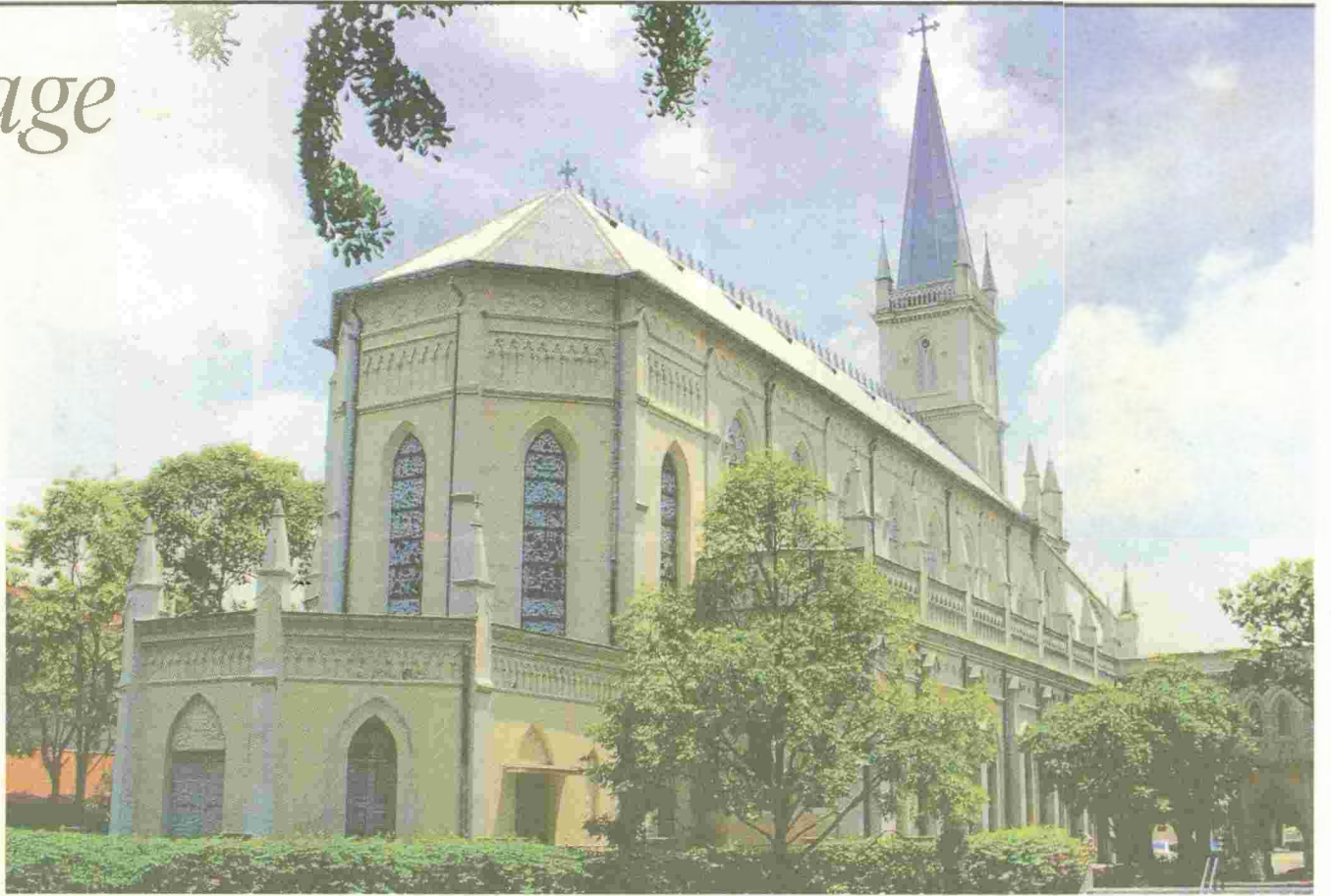
Chijmes, a former convent converted into a classy retail and F&amp;B venue.

So, on Aug 1, 1993, a statutory board called the National Heritage Board was formed under the auspices of the Ministry of Culture, Community and Youth. As the custodian of Singapore's heritage, the NHB is "responsible for telling the Singapore story, sharing (its) experience and imparting (its) spirit".