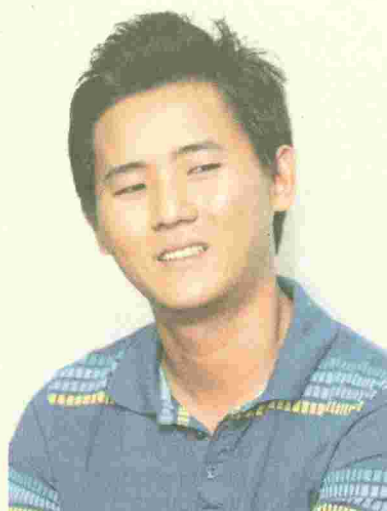
Tan is in love with drifting.