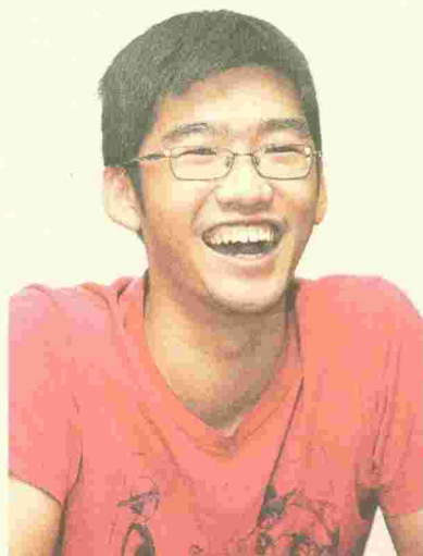
Ee says drivers will pair up.