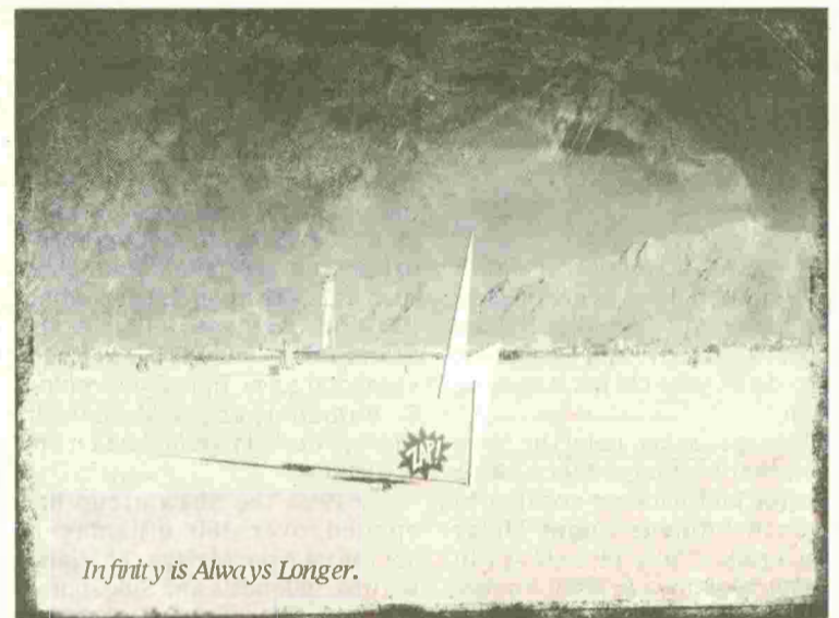
Infinity is Always Longer.