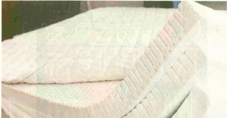
Test the mattress first before making your purchase.