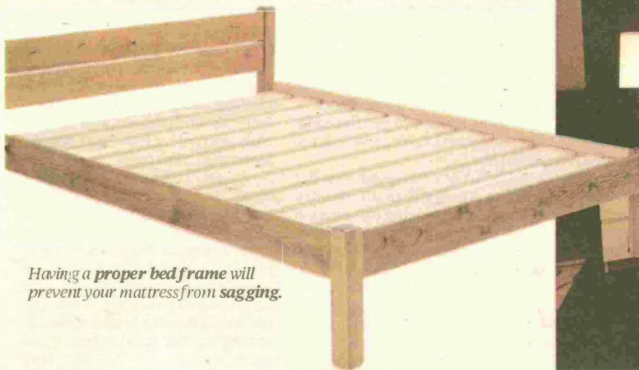
Having a proper bed frame will prevent your mattress from sagging .