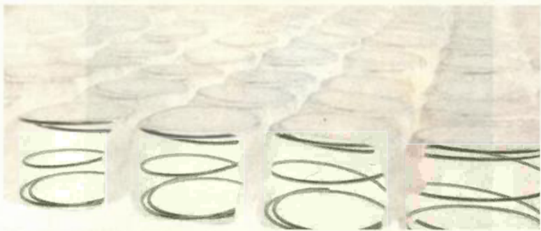
Quality of coil is also important.

Goodnite showrooms, he adds, allow customers to do this. Slumberland allows you to BYOP — Bring Your Own Pillow — when you test its mattresses. Of course, you're advised to dress comfortably as you will be testing these beds in a public showroom.