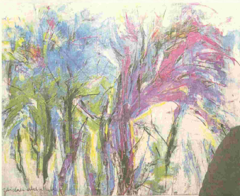
Kala Rimbun IV