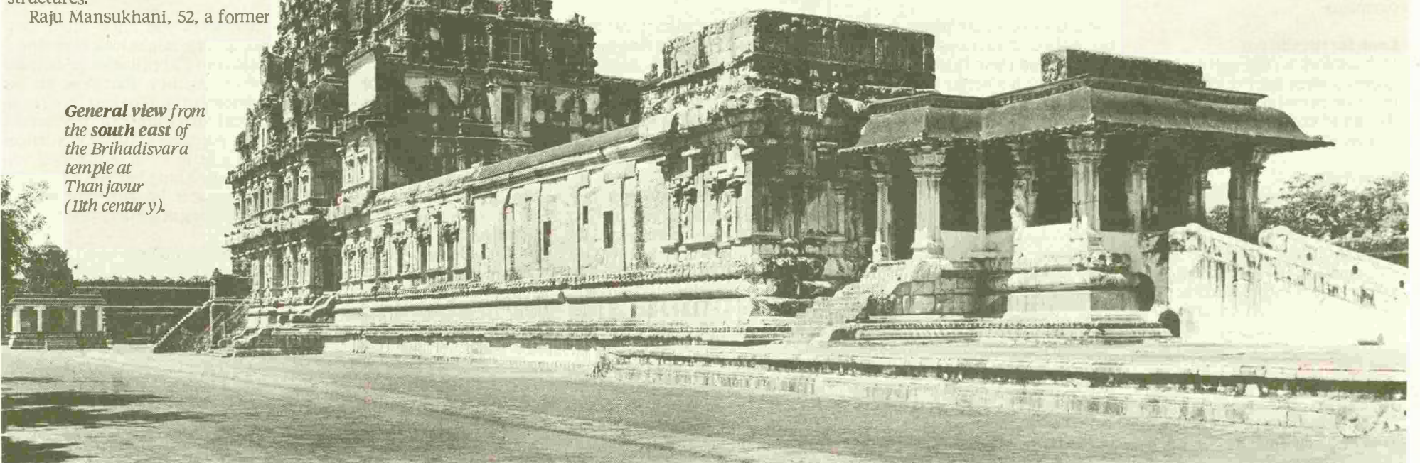
General view from the south east of the Brihadisvara temple at Thanjavur (11th century).

The exhibition will continue in Sungai Petani from May 23 for 10 days. Details at http://indianhighcommission.com.my