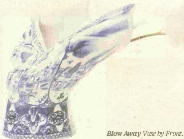
Blow Away Vase by Front.

Pixel Persian. This is a carpet by the curator of the exhibition, Volker Albus. The carpet is said to demonstrate a manufacturing technique where squares of different sizes are woven to form a whole which then becomes a picture. True, the geometrical grid of the pattern is made