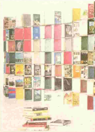
Books by Werner Aisslinger.

Pixel Persian. This is a carpet by the curator of the exhibition, Volker Albus. The carpet is said to demonstrate a manufacturing technique where squares of different sizes are woven to form a whole which then becomes a picture. True, the geometrical grid of the pattern is made