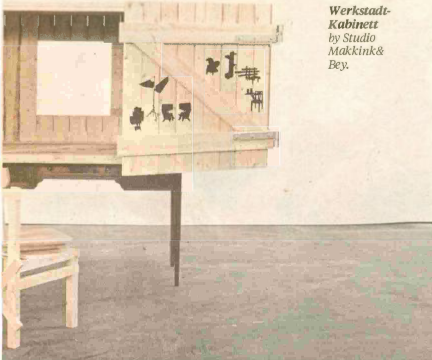
Werkstadt-Kabinett by Studio Makkink& Bey.