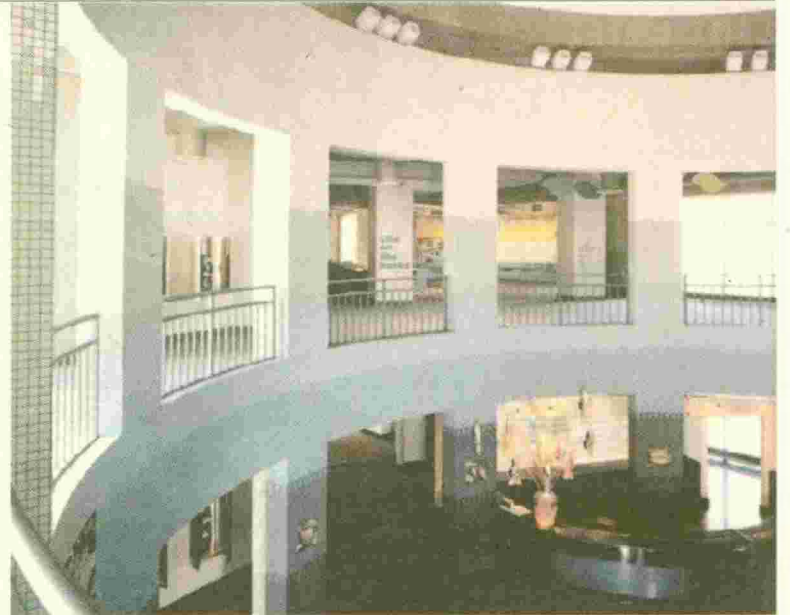
Thoman Kean New Jersey State Aquarium

building I design may not be near the main road. I will place the building in the middle of the land and design a driveway because the journey to the building is as important as the building itself."