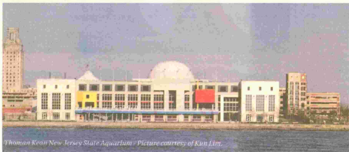
Thoman Kean New Jersey State Aquarium