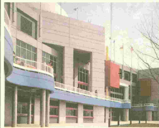
Thoman Kean New Jersey State Aquarium