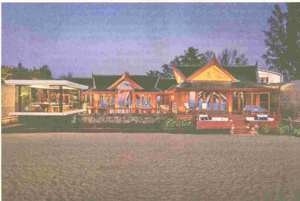
Iniala Beach House, a unique and luxurious hotel with a charitable initiative.