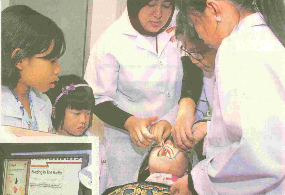
Kids get to explore various vocations here.