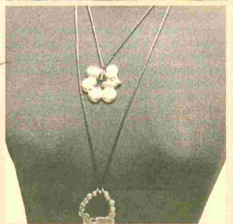
Crash course in pewtersmithing