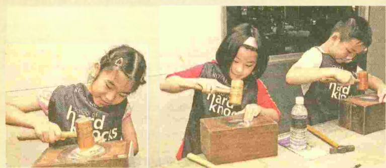
Children can learn a lot at the interactive area

Hall Of Frames: As its name suggests, this hall has a sample of every photo frame that Royal Selangor has ever produced.